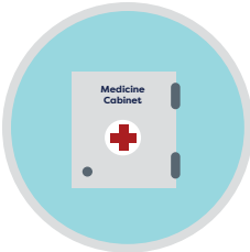
Home Medicine Cabinet